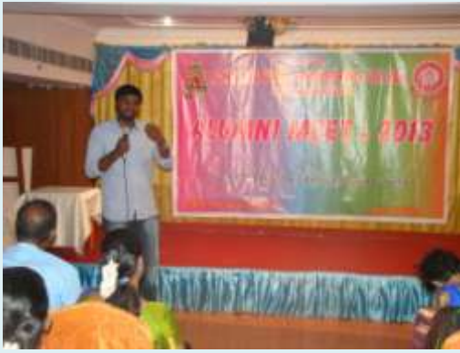
One of the Alumni addressing the gathering