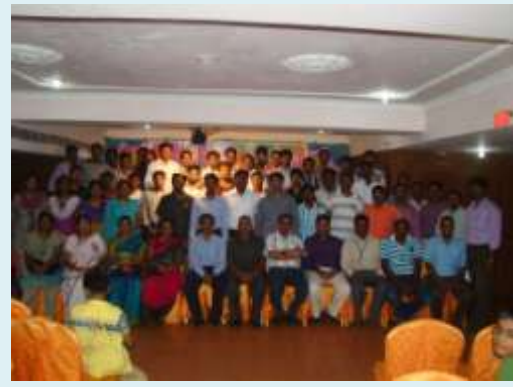
Group photo on the memorable occasion