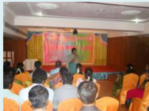
One of the Alumni addressing the gathering