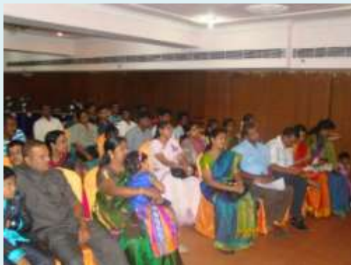
Gathering of Alumni on the meet

The alumni meet for the Electrical and Electronics Engineers has been jointly organized by the department of Electrical and Electronics Engineering and APEC Alumni Association on 18.08.2013 @ Hotel Vijay Park, Chennai. Nearly fifty alumni participated in the meet. Faculties and students of Electrical and Electronics Engineering also participated in the meet. They were very happy to participate in the meet. Many of the alumni shared their knowledge and experience to the present students for their career advancement and also gave valid suggestions to the department for development. They have assured that they would give full support to the department as well as any kind of development.